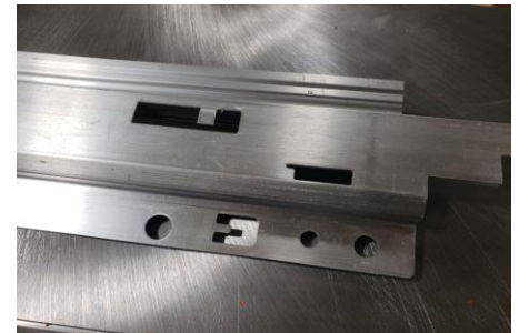
Appliance Frame Component