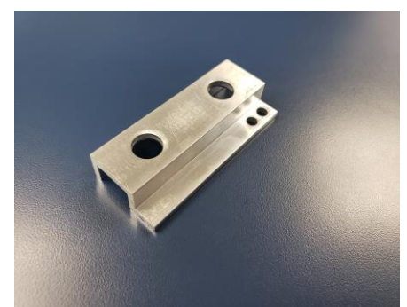
Electrical Component Part

The photos above represent just a small sample of the many different extruded aluminum parts fabricated on tools and machinery designed and built by Ross Engineering & Machine. For more information and many more examples and information please visit us at www.rosseam.com . Please call us at Ross to discuss any questions you may have about our capability or current capacity.