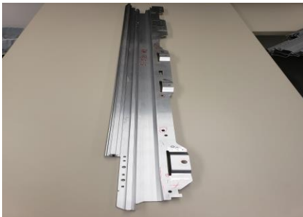
Automotive Frame Parts