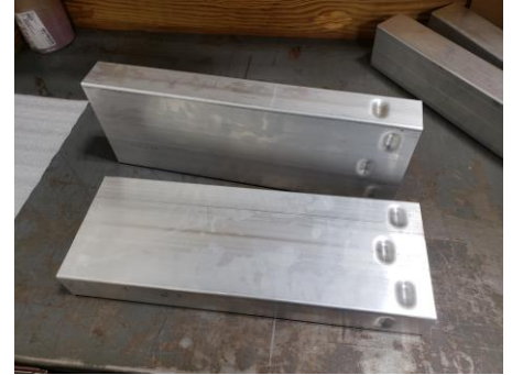
Automotive Bumper Crush Can