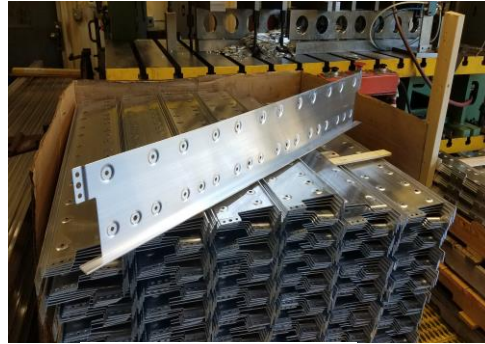
Motor Home Frame Parts