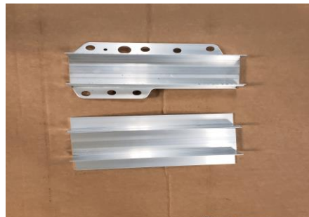
Automotive Seat Track