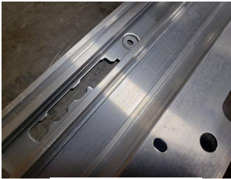
Automotive Sun Roof Track

Send Quote Requests to: design@rosseam.com