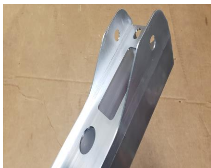
Modular Shelving Component