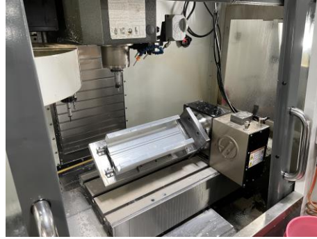
4th Axis Machining