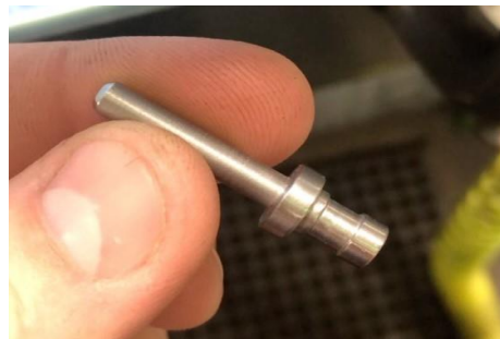
Large or Micro Parts