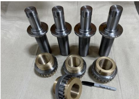
Reverse Engineered Maintenance Parts