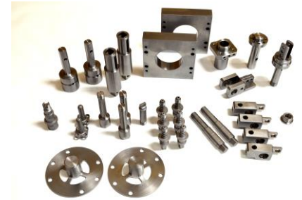
Complete BOM Parts