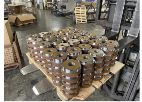
Production Machining Simple or Complex