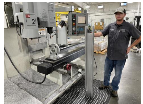
Low to Mid Volume Extrusion Machining

The photos above represent just a small sample of the many different parts expertly machined by Ross Engineering & Machine. For more information and many more examples and information please visit us at www.rosseam.com . Please call us at Ross to discuss any questions you may have about our capability or current capacity. References are available.