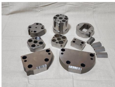
Wire Burn Tool Steel Stamping Die Parts