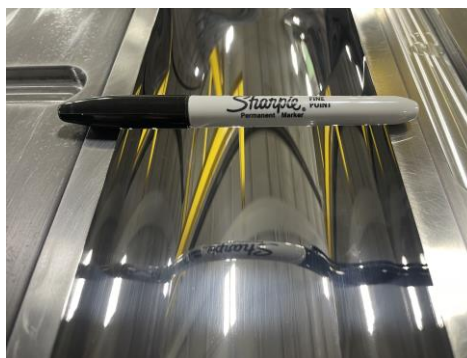
Mold Quality Machining and Polishing